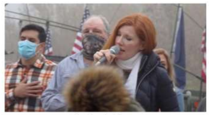
Star Spangled Banner