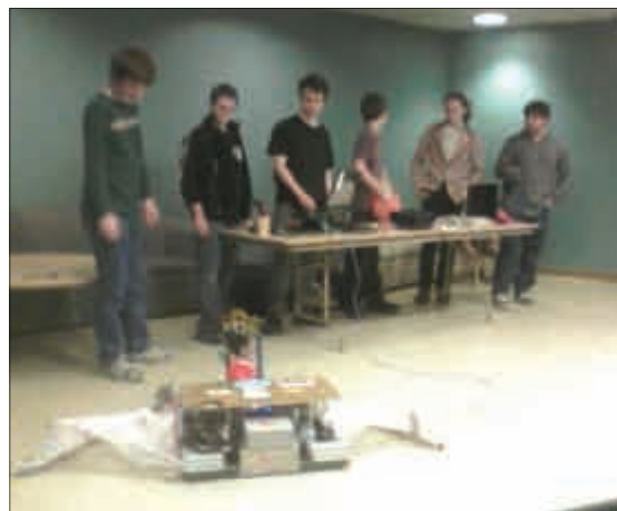
FRC Team 1432 demonstrates their robot at spring presentation

Want to help? The Umatilla team could use some more mentors and you don't have to be an engineer to be one, just be a trust worthy adult interested in helping kids. If you're interested