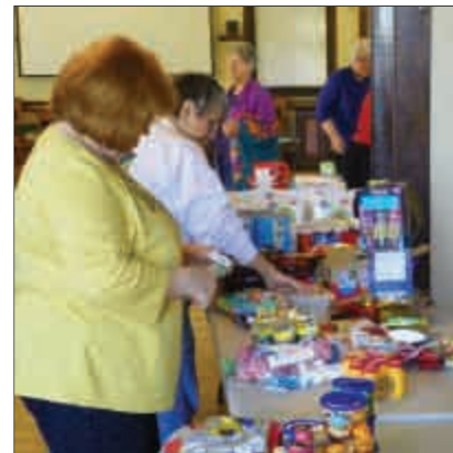
Westside Quilters Guild ladies organizing the boxes